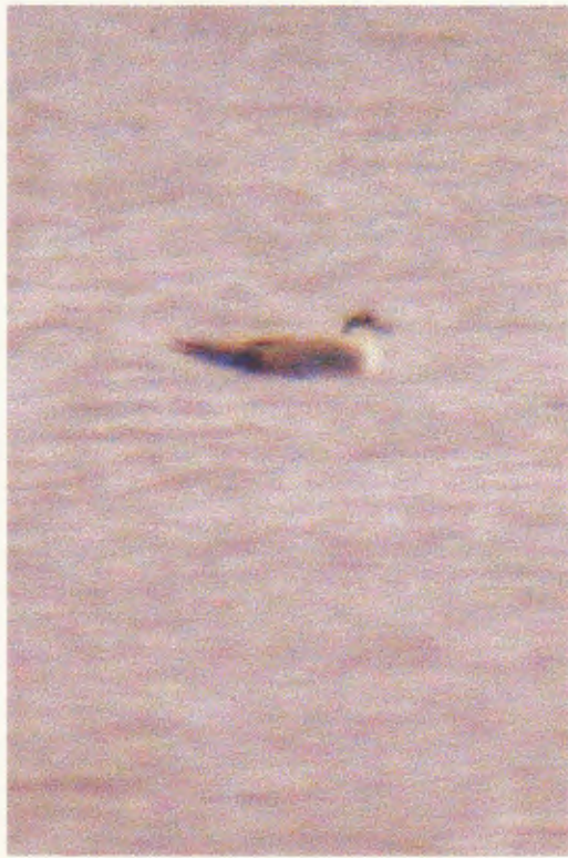
Longtailed Jaeger Sarasota Lake PA 8-27-05